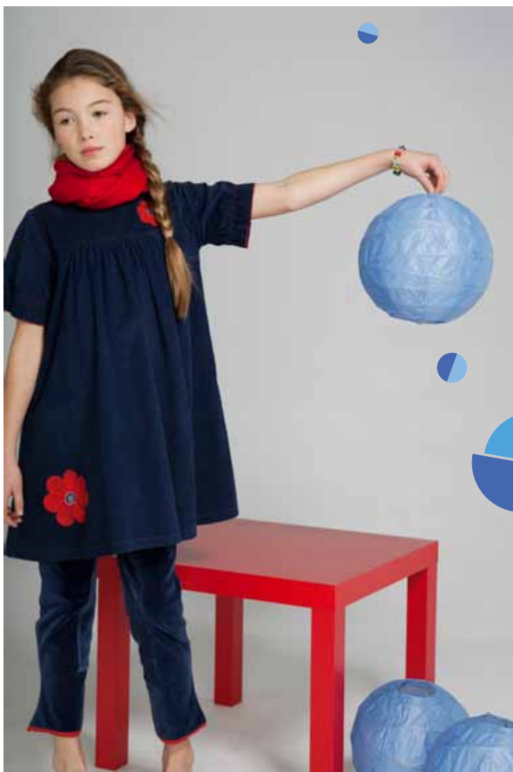
Halley Cord Dress , Navy. Berry version (p18). Cotton corduroy. Ribbon flower applique. 0309. Mimi Velvet Stretch Jodphur , Navy. Choc Brown version (p3). Cotton lycra blend velvet. Red trim at pant hem. 0003.