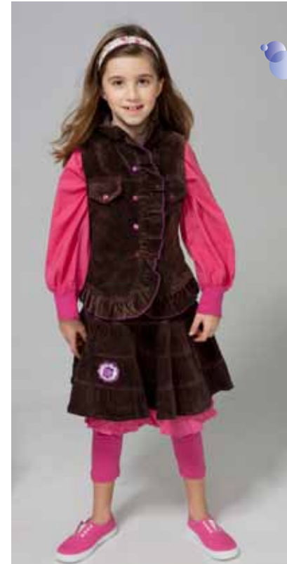
Sasha Ruffle Velvet Vest , Choc Brown. Embroidered at back. Navy (p15). Cotton velvet. 3011. Katie Puff Sleeve Tee, Rose. Also available in Light Purple and Red (not shown). Cotton voile and knit jersey. 0004. Gemma Mini Cord Tiered Skirt , Choc Brown corduroy. Rose underskirt, cotton poplin. Navy version (p26). 4648. Helena Cotton Leggings , Rose. Navy (p15). Light Purple (p22). Cotton jersey. 0314.