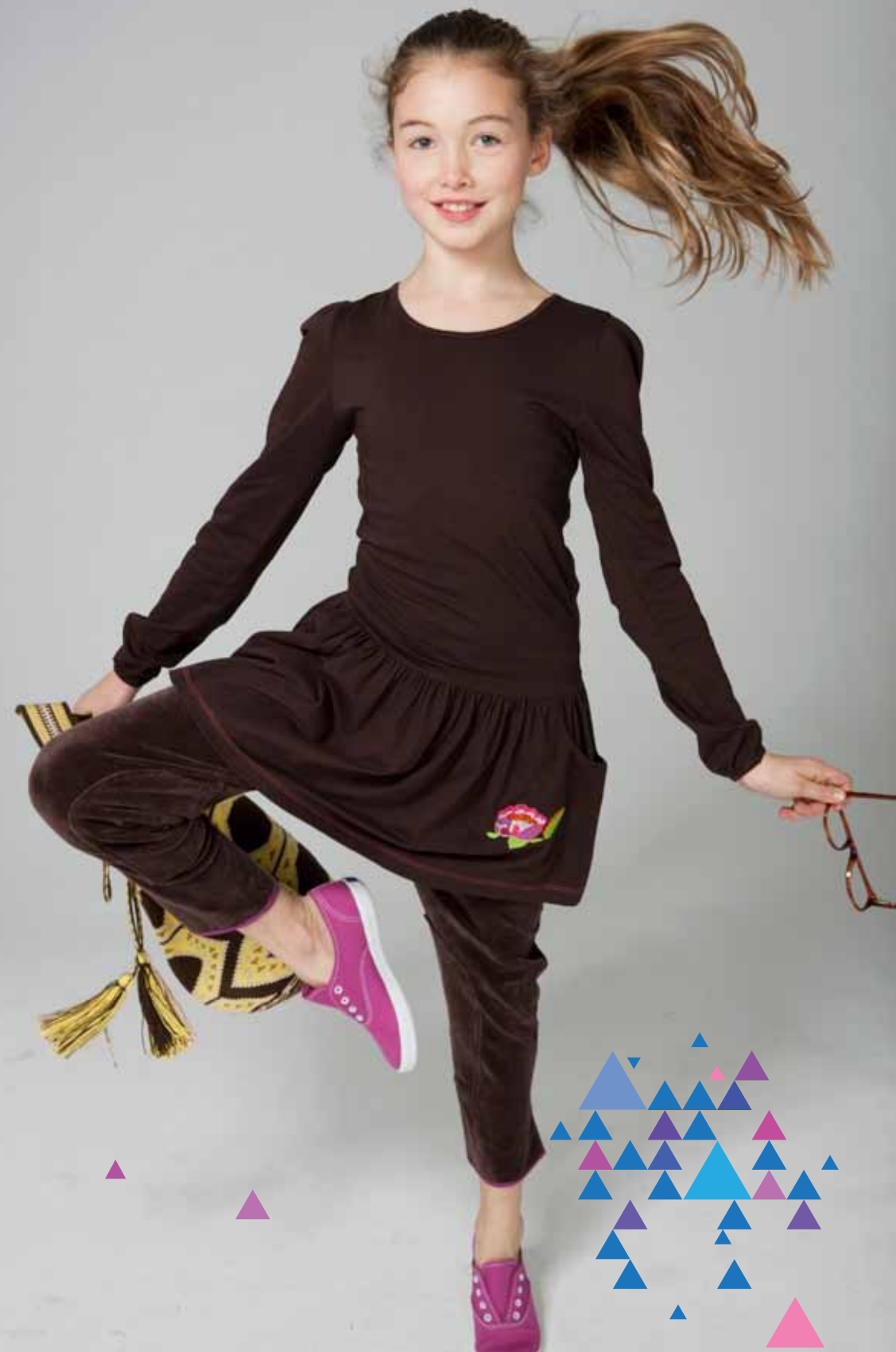
OPPOSITE PAGE. Fiona Drop Waist Knit Dress , Choc Brown. Azure Blue (p9). Knit Jersey. Embroidered at skirt. 0468. Mimi Velvet Stretch Jodphur , Choc Brown. Navy version (p24). Cotton lycra blend velvet. Rose trim at pant hem. 0003.