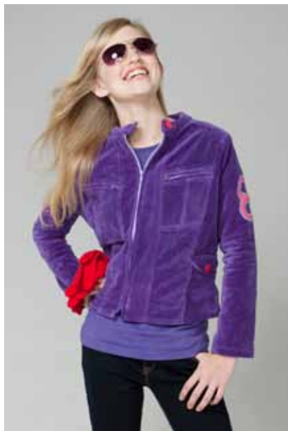
THIS PAGE & OPPOSITE PAGE. Lyla Velvet Embroidered Dress , Navy + Red combo. Choc Brown + Rose combo (p16). This dress is also available in cotton corduroy in both color combos. Embroidered at chest and center front. 0369. Aurelie Cord Ruffle Front Dress , Navy. Embroidered at back shoulder. 0002. Emily Gypsy Dress , Navy solid. 2018. Lily Transeasonal Party Dress , Navy+ Red. Berry + Rose (p14), Blue floral print (p25). Cotton poplin. 0464. Ines Velvet Biker Jacket , Light Purple cotton velvet. Lined. 5448.