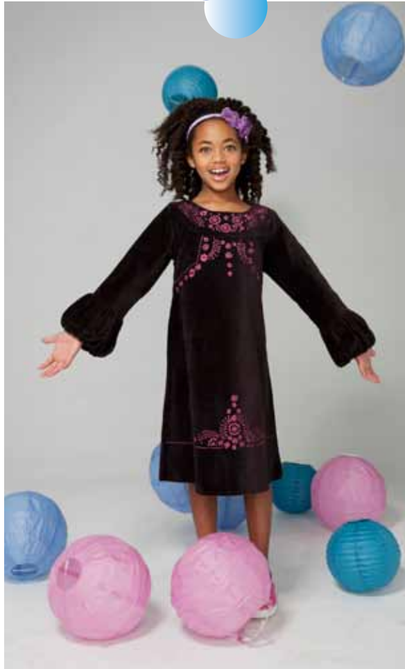
Lyla Velvet Embroidered Dress , Choc Brown + Rose combo. Navy + Red combo (p5). This dress is also available in cotton corduroy in both color combos. Embroidered at chest and center front. 0369.