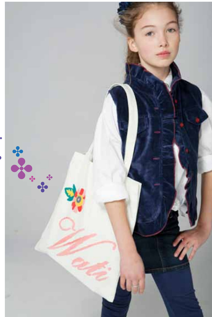
THIS PAGE. Sasha Ruffle Velvet Vest , Navy. Embroidered at back. Choc Brown (p17). Cotton velvet. 3011. Helena Cotton Leggings , Navy. Rose (p 2 & 14), Choc Brown (p16), Light Purple (p22). Cotton jersey. 0314. Model's own shirt and denim skirt.