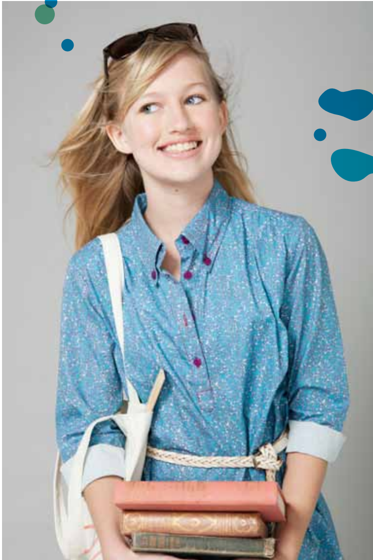
THIS PAGE & OPPOSITE PAGE. Felicity Preppy Shirt Dress. Blue floral print. Cotton poplin. 0465.