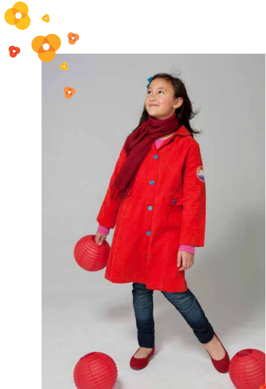
THIS PAGE & OPPOSITE PAGE. Camilla Embroidered Corduroy Coat, Red. Cotton Corduroy. Lined. Embroidered at back. 0320.