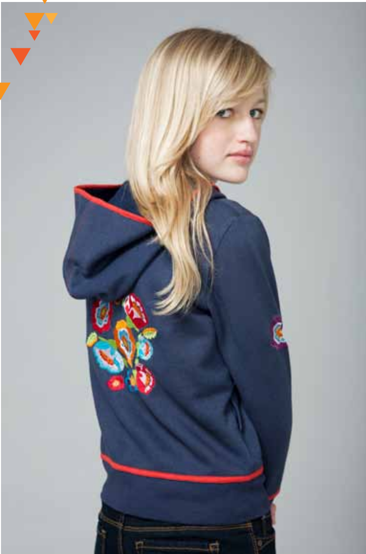
THIS PAGE & OPPOSITE PAGE. Martine Zip Front Hoodie Jacket , Navy. Embroidered back and front. Pockets. Lined hood. Cotton brushed jersey. 0001.