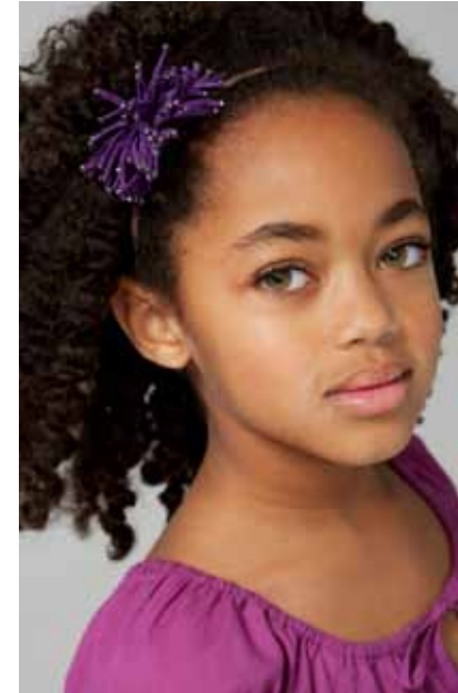
OPPOSITE PAGE. A sampling of Wati hair accessories made exclusively by A Finishing Touch : suede, fabric, as well as sequin flower hairbands, silk flowers and other assorted clips and elastics that co-ordinate with our color palette.