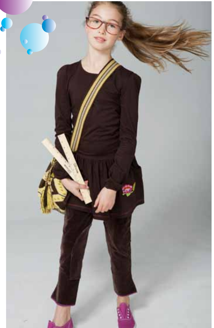
Fiona Drop Waist Knit Dress , Choc Brown. Azure Blue (p9). Knit Jersey. Embroidered at skirt. 0468. Mimi Velvet Stretch Jodphur , Choc Brown. Navy version (p24). Cotton lycra blend velvet. Rose trim at pant hem. 0003.