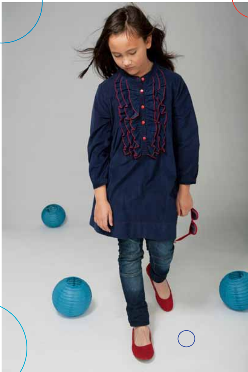
THIS PAGE. Aurelie Cord Ruffle Front Dress , Navy. Choc Brown (p16). Cotton corduroy. Embroidered at back shoulder.0002.