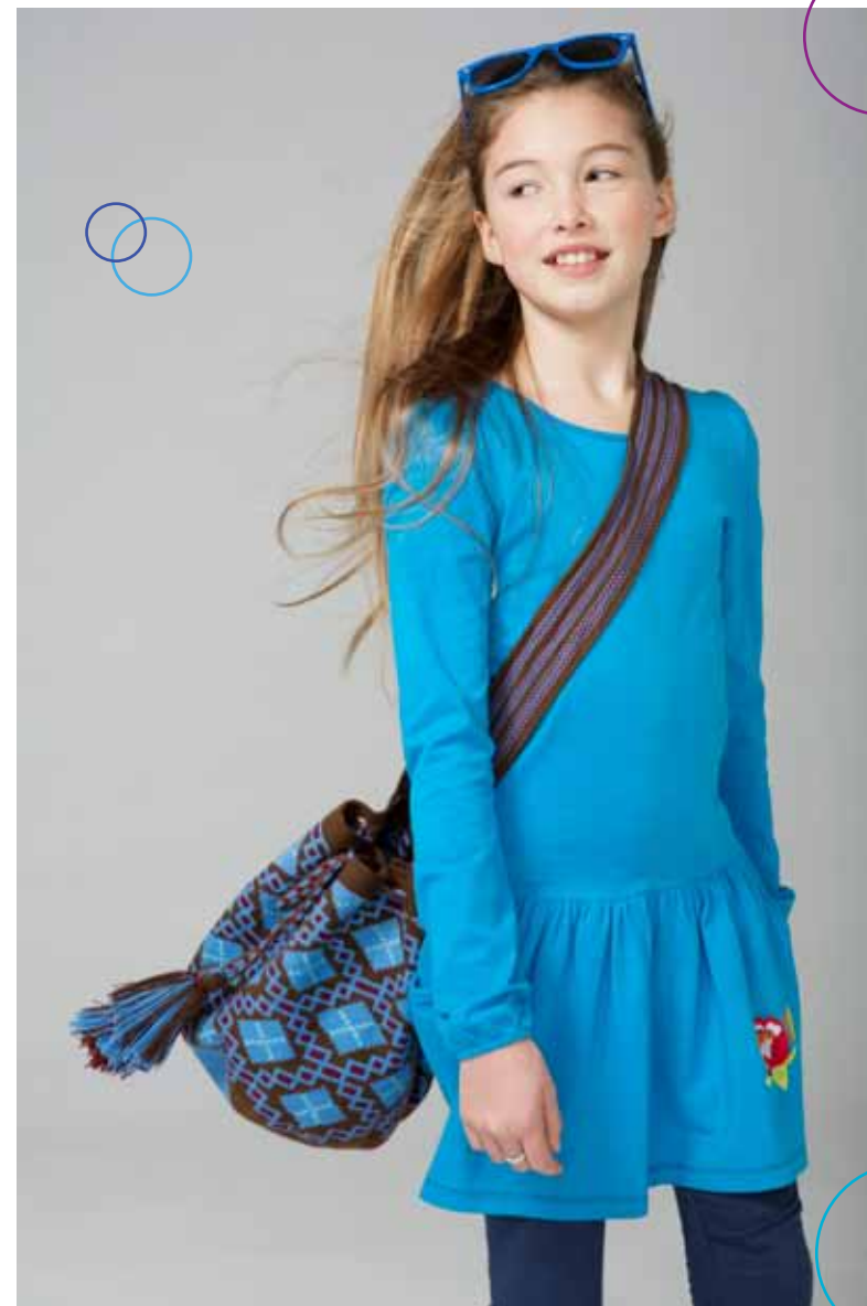
THIS PAGE. Fiona Drop Waist Knit Dress , Azure Blue. Choc Brown (p3). Knit Jersey. Embroidered at skirt. 0468.