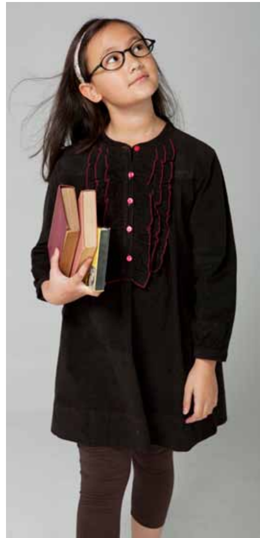
Aurelie Cord Ruffle Front Dress , Choc Brown. Navy (p8). Cotton corduroy. Embroidered at back shoulder.0002. Helena Cotton Leggings , Choc Brown. Rose (p2), Navy (p15). Light Purple (p22). Cotton jersey. 0314.