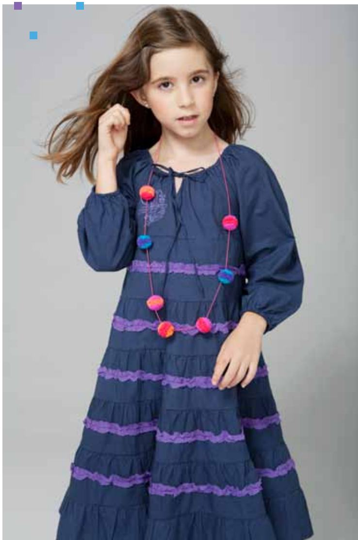
THIS PAGE. Emily Gypsy Dress , Navy. Rose floral print (p2). Blue floral print (p18). Cotton poplin. Lined. 2018.