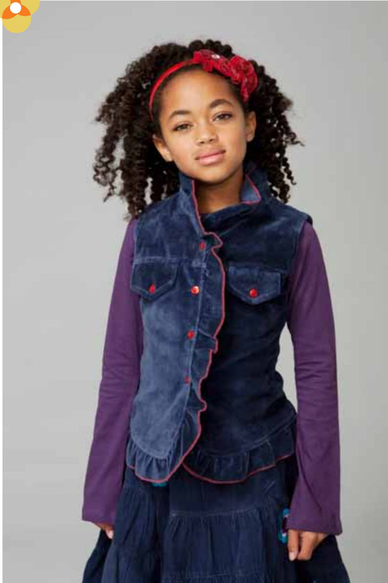
THIS PAGE. Sasha Ruffle Velvet Vest , Navy. Embroidered at back. Choc Brown (p17). Cotton velvet. 3011. Model's own tee shirt. Gemma Mini Cord Tiered Skirt , Navy corduroy. Red cotton poplin underskirt. Choc Brown version (p17). 4648.