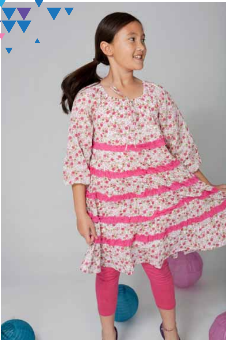
THIS PAGE. Emily Gypsy Dress , Rose floral print. Blue floral print (p18) and Navy solid (p20). Cotton poplin. Lined. 2018. Helena Cotton Leggings , Rose. Navy (p15), Choc Brown (p16), Light Purple (p22). Cotton jersey. 0314.