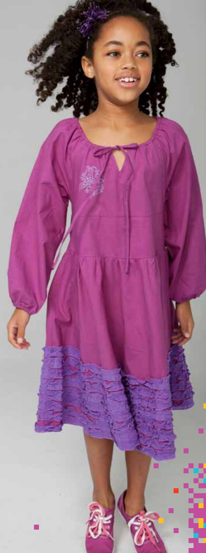
OPPOSITE PAGE. Maya Ruffle Hem Dress , Berry + Light Purple ruffles. Cotton poplin. Lined. 2188.